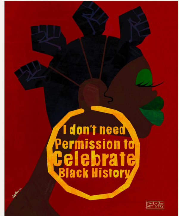
Art by: deelasheart on Instagram

This analysis explores recurring themes under the #BlackLivesMatter, aiming to better understand how social media users respond, contribute to, and support Black justice.